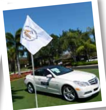
A Mercedes for a hole in one!