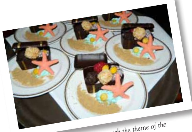
Dessert prepared to match the theme of the evening – the Starfish!