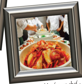
Dish prepared by future chef - Miles McMullen