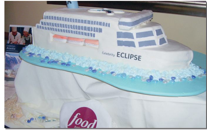
Travel displays included a Cruise Ship cake