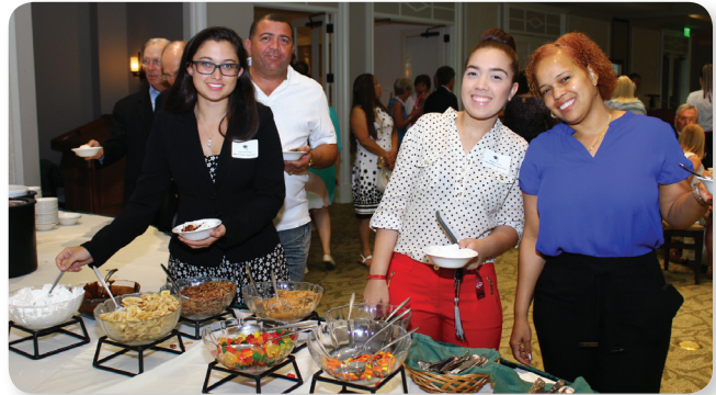
Everybody enjoyed the ice cream bar