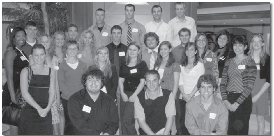
Students in attendance at the luncheon

The students addressed the Founders Fund members, informing them about their educational goals, accomplishments and career aspirations. They also thanked the members for their tuition assistance and described how the scholarships have aided them in their higher education schooling.