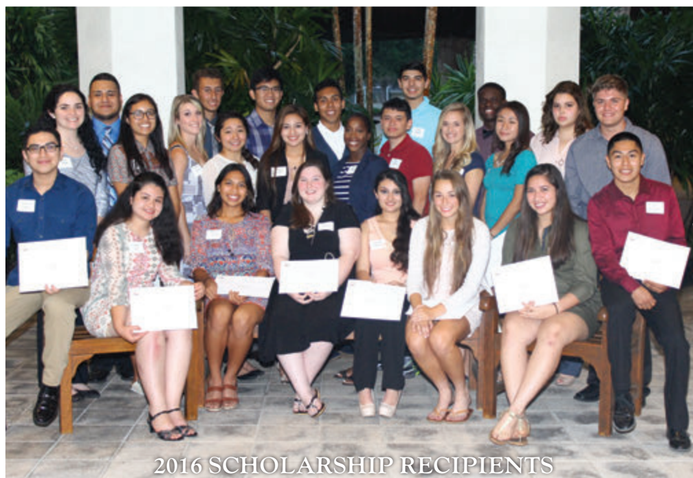
2016 SCHOLARSHIP RECIPIENTS