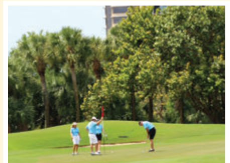
Golfers making the final putt