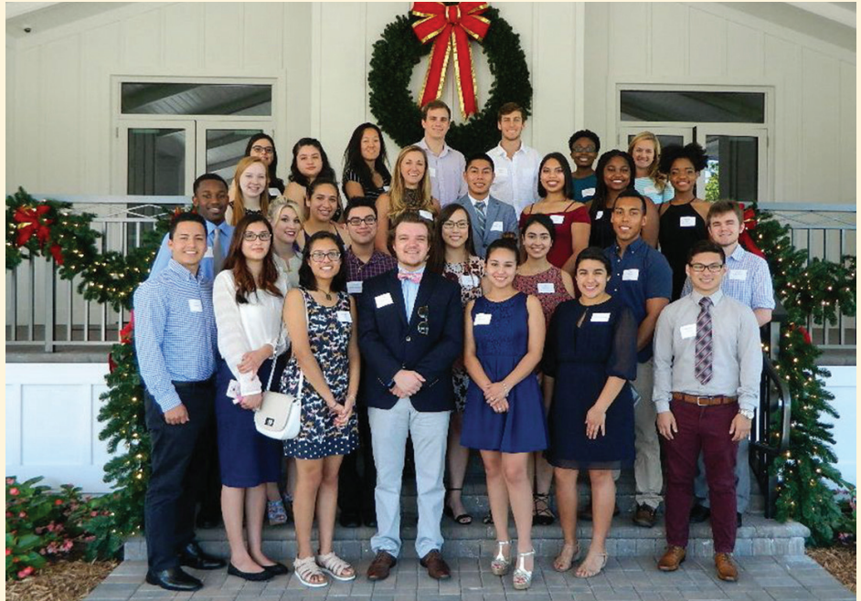
Founders Fund Scholarship Students attend holiday luncheon

The Founders Fund held our Annual Scholars Luncheon on Thursday December 29 at the Country Club of Naples while the new Club at Pelican Bay is under construction. Scholarship recipients and benefactors of The Founders Fund gathered together at the annual event to celebrate the accomplishments of the scholarship students.