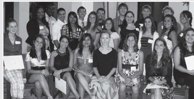
Scholarships were awarded to students from eleven area schools. Congratulations, all!