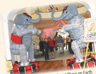
Entering the Greatest Travel Show on Earth