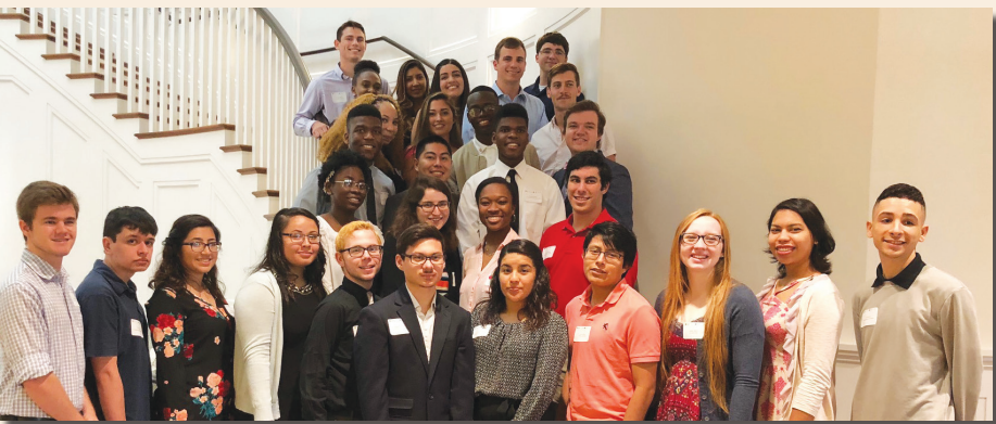
Founders Fund Scholarship Students

It was great to see our students home for the Founders Fund Annual Scholars Luncheon which was held on Friday December 29 at Club Pelican Bay with nearly 75 guests in attendance. Scholarship recipients and benefactors of The Founders Fund gathered together at the annual event to celebrate the accomplishments and aspirations of the current scholarship students.