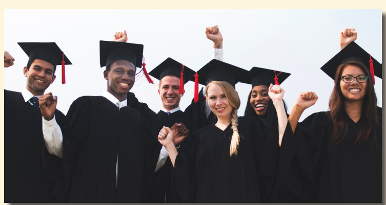
Future scholars are relying on us to help them reach their educational and career goals.

As you know, we were not able to have our big fundraising event which is our major means of donations for the scholarships, however, 24 Collier County students were still awarded scholarships for 2020, and the Founders Fund Board of Trustees will grant more scholarships in 2021. Students depend on us and we will not let them down; scholarships will be grated to deserving Collier County students in spite of not having a fundraiser.